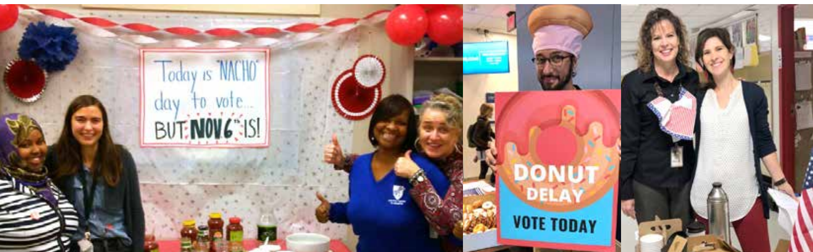
Minneapolis, Minnesota State College Faculty and Mounds View educators all took part in worksite action leader activities to motivate their colleagues to vote. They joined educators from across the state in this effort.

While we won't have the 2018 numbers until early next year, we know that through our worksite action leader program, educators were pledging to vote in record numbers.