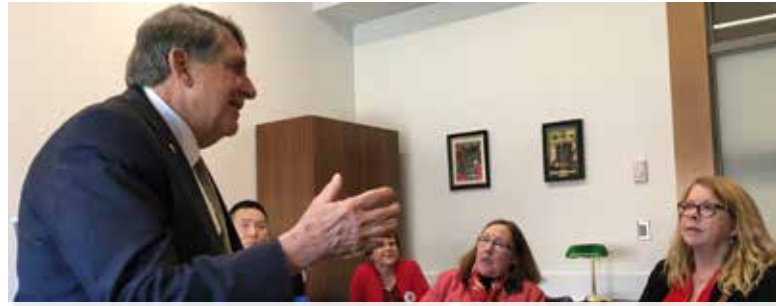
ECCE and ABE teachers met with Sen. Jerry Newton during a lobby day in 2017.

Committee hearings are a focal point of the legislative process at the Capitol and give educators the chance to share their stories and make their voices heard. Contact Education Minnesota's lobby team at lobbyteam@edmn.org if you're interested in testifying before a legislative committee. The team can help you prepare your remarks, make sure you're on the agenda and get you to the right place at the right time.