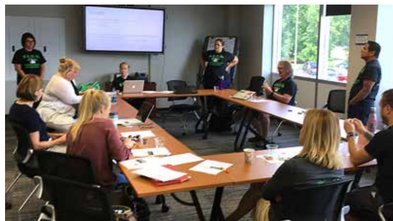
The Shakopee Educators for Equity and Diversity met at Education Minnesota's St. Paul office this summer to work on plans for their projects throughout the school year.

"Don't expect immediate change," she said. "You want to start an equity team and want everyone to change right away? Tiny baby steps will get you to where you want to be."