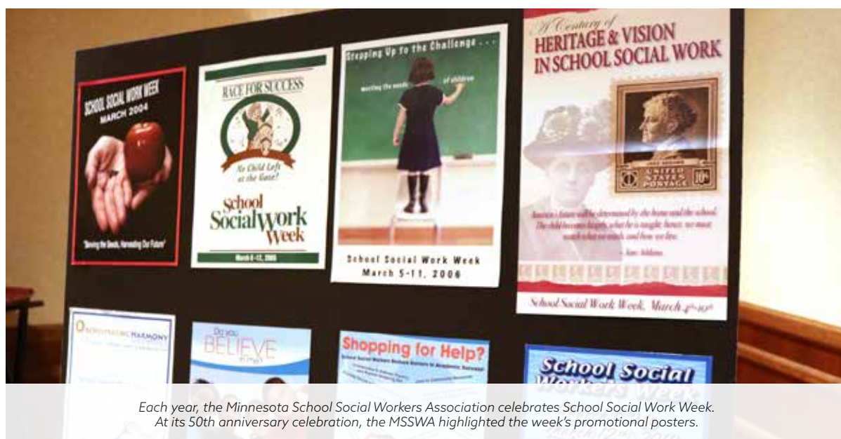
Each year, the Minnesota School Social Workers Association celebrates School Social Work Week. At its 50th anniversary celebration, the MSSWA highlighted the week's promotional posters.

As mental health professionals and practitioners, school social workers are dual licensed by the Board of Social Work and the Minnesota Department of Education.